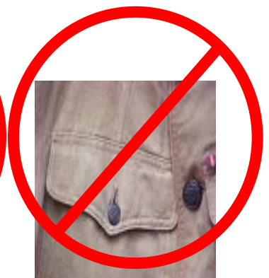
No Cargo Pants type pockets