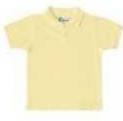
Pale Pastel Yellow